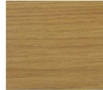
Hunter Douglas - Box Series Wood Soffit White Oak 8491