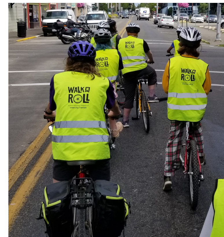
Earn-A-Bike students practicing bike safety skills on the road.