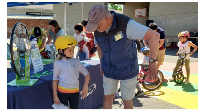
Walk N Roll volunteer teaching hand signals at the Great Olympia Bike Rodeo.

The Avanti Bikes! program rode bikes to the Hope Bike Shop for a tour and to share their stories of learning bike mechanics.