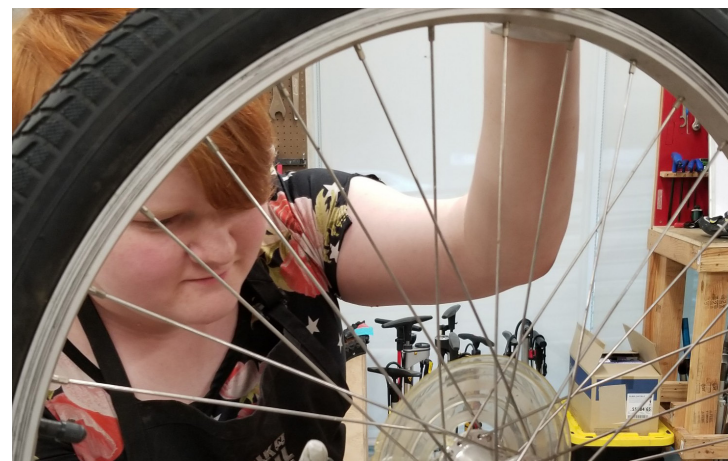
Youth volunteering in the Walk N Roll bike shop.