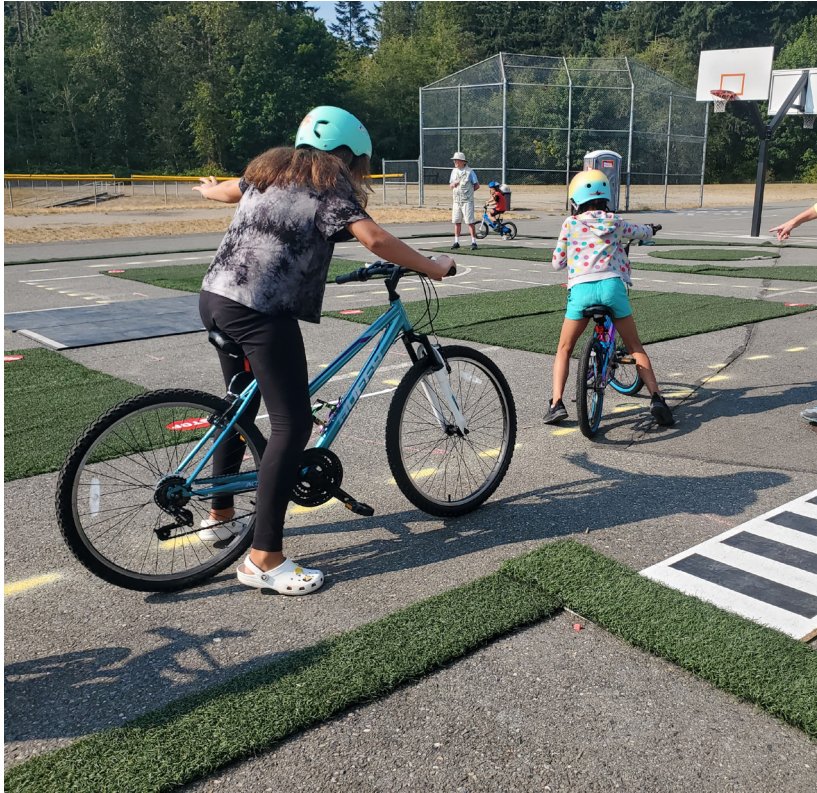
Mobile Traffic Garden at YMCA Summer Camp.