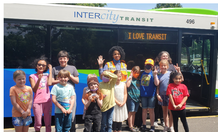
We took Summit Virtual Academy on a Rolling Classroom field trip.