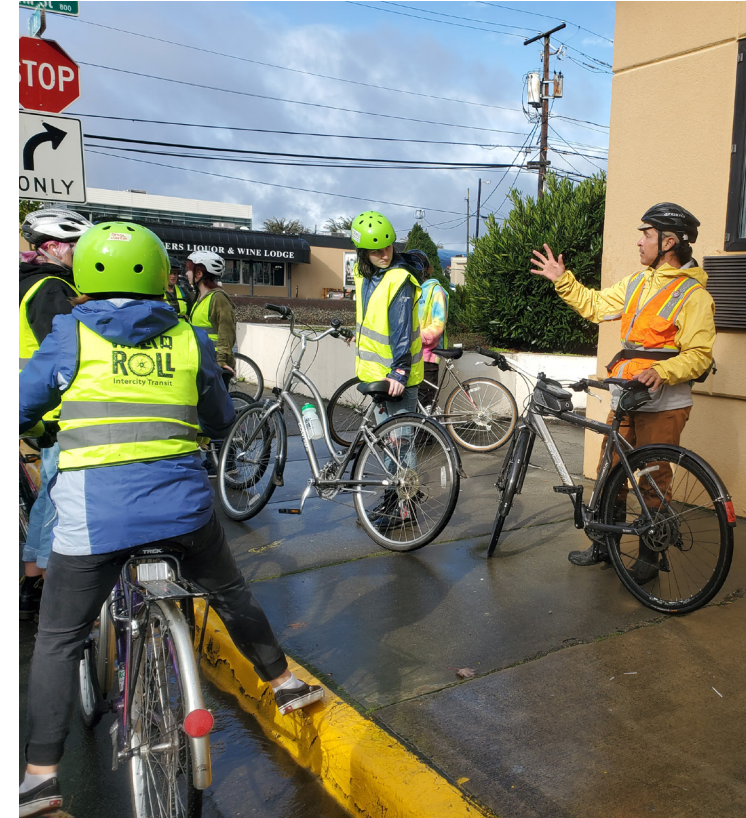
Avanti students learning and practicing bicycle safety skills.