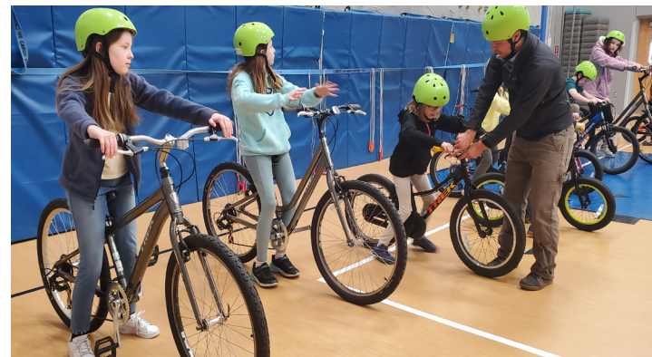
Tumwater Hill students learning to ride a bike for the first time.

We provided transit education to youth through two school bus visits and five Rolling Classroom field trips. Participants met a bus operator, toured a bus and learned why transit is important to our community.